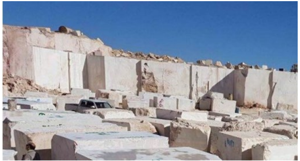
Fig. 2. A building stone mine

The Rákosi limestone is 100 - 150 m thick, large-grained shallow-sea sediment. Its material is made up of reddish algae, snails, shells, sea-urchins and bryozoas. The color of the rock is yellowish-white. Its density is between 1750 kg/m3 and 2500 kg/m3 in the air-dry state. Its compressive strength is typically around 10 MPa. (Mednyánszky, 2017, Török, 2008).