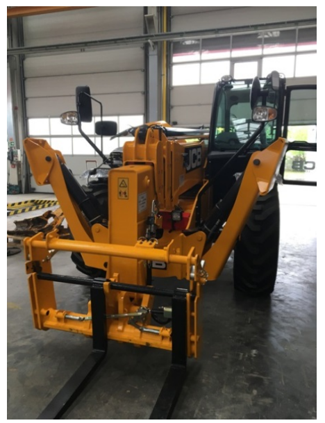
Fig. 3. The basic machine of the project, a JCB Construction Loadall

The basic machine for the adapter is provided by a JCB Construction Loadall (Fig. 3.). Due to the large load capacity and design of the machine, it is used for different workflows in many areas. Its multifunctional applicability ensures that the hydraulic system of the requested machine has a pump capacity of 140 l/min and a working pressure of 260 bar.