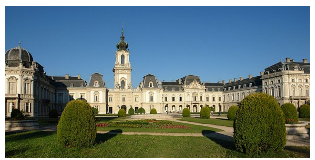
Fig. 1. Festetics Palace in Fertőd

It became a popular building material from the 18th century. They were easy to mine and transport, massive amounts of blocks were transported to the buildings of nearby big cities. Much of the houses in Vienna and Bratislava were made of this material, but in almost every village around Sopron we find buildings built from "Rákosi" stone. At first only the temples were built out of it (e.g. the Saint Michael church in Sopron, Stephansdom in Vienna), but soon it was the basic material of the residential buildings. We could mention the Esterhazy Castle in Fertőd or the Festetics Palace in Keszthely (Fig. 1.). In addition to the building work, it also served as a base for many tombs, memorials and sculptures.