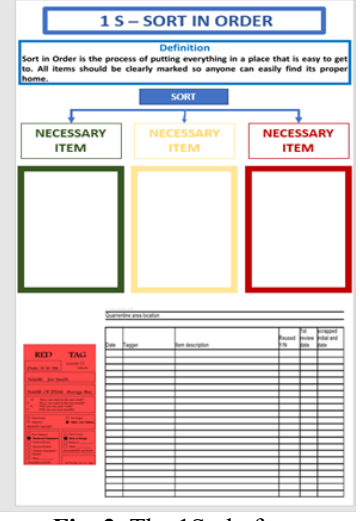
Fig. 2. The 1S platform

The first facet of the cube is dedicated to learning the principles of the first S. This contains: