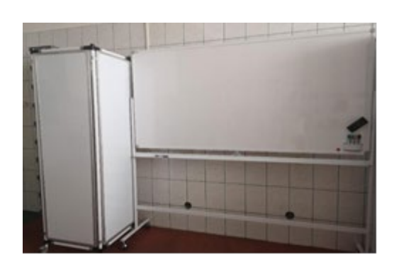
Fig. 1. Aluminum Lean Platform