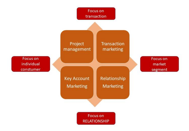
Figure 2. Industrial market analyzed based on seller-buyer interaction (adapted after Jozsa at co., 2005)

Useful marketing and technical communication at all time. This can be realized using the omni-channel approach, wherever the customer is looking for information (or product) the supplier needs to be there: Google Search by search engine optimization, web pages with text, infographic or video tutorial based frequently asked questions, e-mail, segmented - targeted newsletters, call centers, personal visits, even chat bots with artificial intelligence backup.