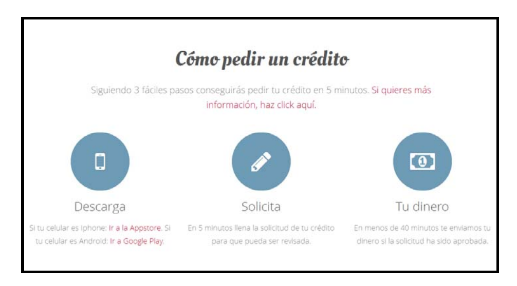
Figure 2. Steps for MobilLender

Advantages of application MobilLender are obvious: