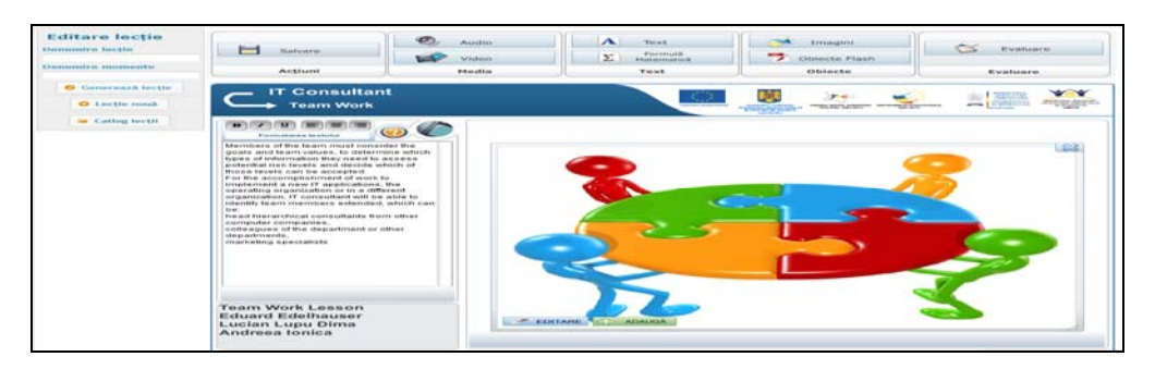
Figure 7. AeL Editor (moment.php) in EduIntegrator

Edu Integrator allows users who do not have programming knowledge to create their own reusable learning objects. The two stages of IT development are brought together in a single user environment, based on a default scenario, is able to create learning objects by linking items that has set in the script. (http://ticavansat.pmu.ro/)