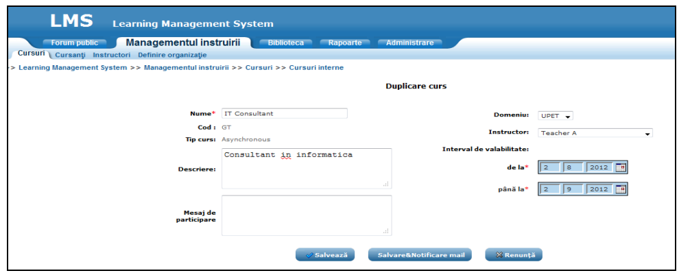
http://7.upet.ro/ael/admin cursuri/creare curs adm trainer.jsp

The technical solution proposed for designing the <a href="http://7.upet.ro/">http://7.upet.ro/</a> portal was to use a Content Management System (CMS). A CMS is a system used to organize and facilitate the creation of web content. This platform facilitates the administration and logistics visual content of a portal. Our portal the following specifications: location - <a href="http://7.upet.ro/">http://7.upet.ro/</a>, PHP - version 5.2.x, Server application- Apache 2.2.x and data base - MySql 5.x.